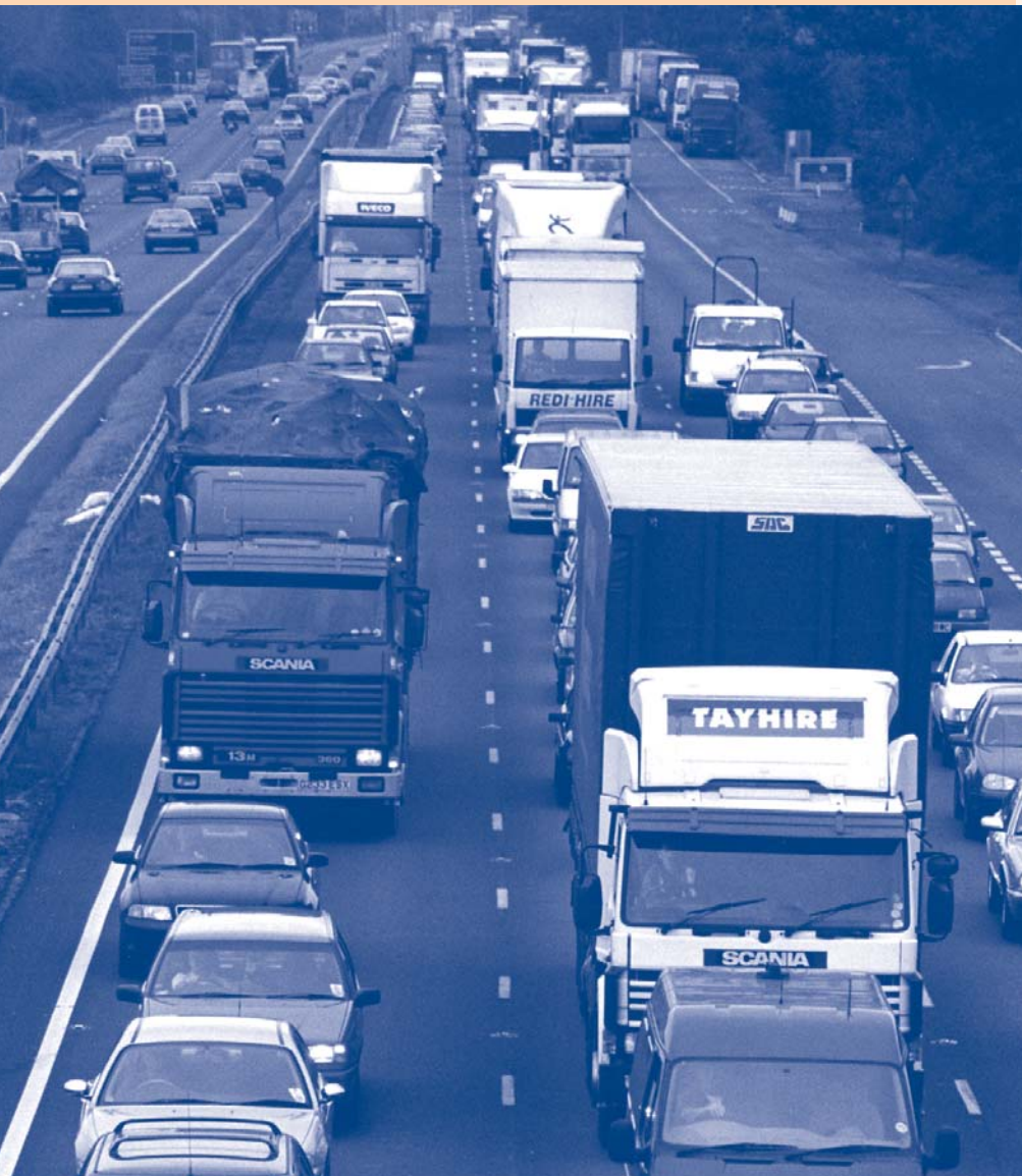
The crowded A14 as it is today

Secretary of State for Transport Department for Transport TWA Orders Unit, Zone 3/11 Great Minster House 76 Marsham Street London, SW1P 4DR